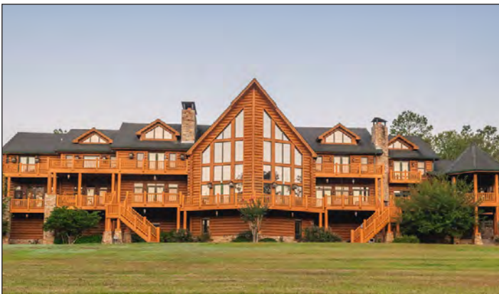
6358 Lake Ella Road, Crestview, Florida

This one-of-a-kind home is currently listed by Jon Kohler & Associates for $9,500,000.