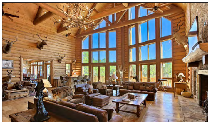
Oversize Living Room

The rustic-chic foyer, with its stone floors and timber staircase, sets the tone for the rest of the house.