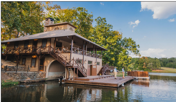
The property’s lake and boathouse were built before the main home so the original owners lived in the boathouse during construction.