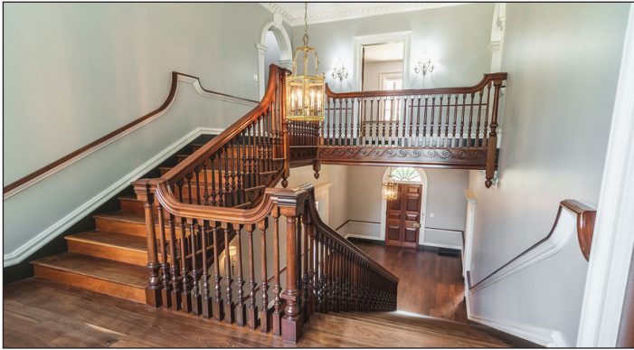
The staircase steps have a smaller than typical rise, something that Ms. Dobbs greatly appreciates. ‘It’s very easy to move up and down the staircase because the rise is only between five and six inches on each step.’