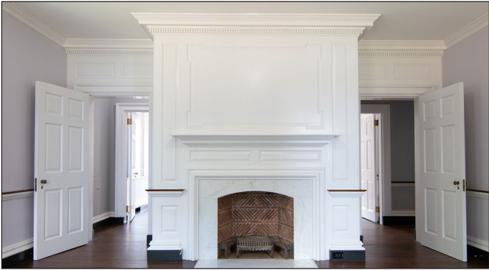
The lavender-walled master bedroom was designed in 1947 with built-in closets. ‘It’s hard to believe that they had built-in closets then, just like we love our closets,’ Ms. Dobbs says. ‘The guy’s side had a tie rack that was built in, it had drawers in the closet. All that’s original to the house.’