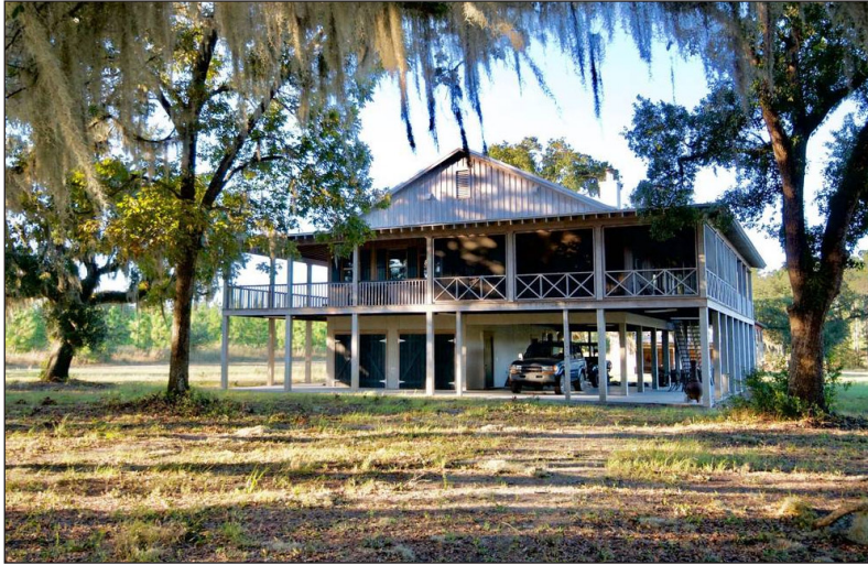
Slater Plantation, Jon Kohler & Associates

Slater Plantation, a hunter's dream, is nestled along the Coosawhatchie River in Ridgeland.