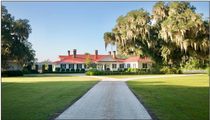
The main house on Tomotley Plantation, CJ Brown