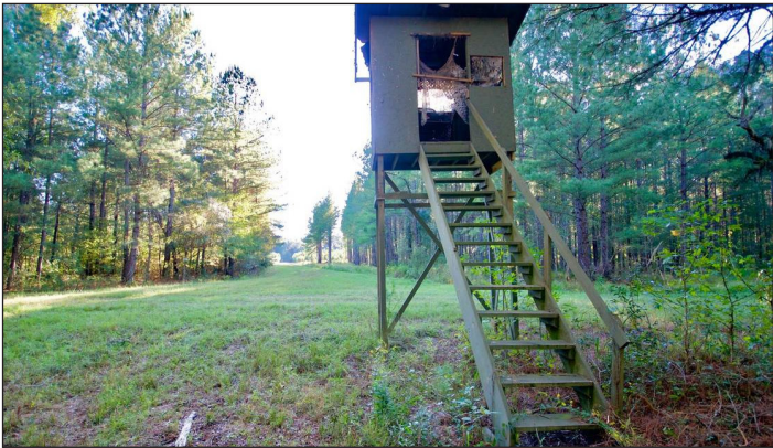
Slater Plantation in Ridgeland SC

Read more here: https://www.islandpacket.com/article243793752.html#storylink=cpy