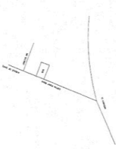
LOCATION MAP (N.T.S.)