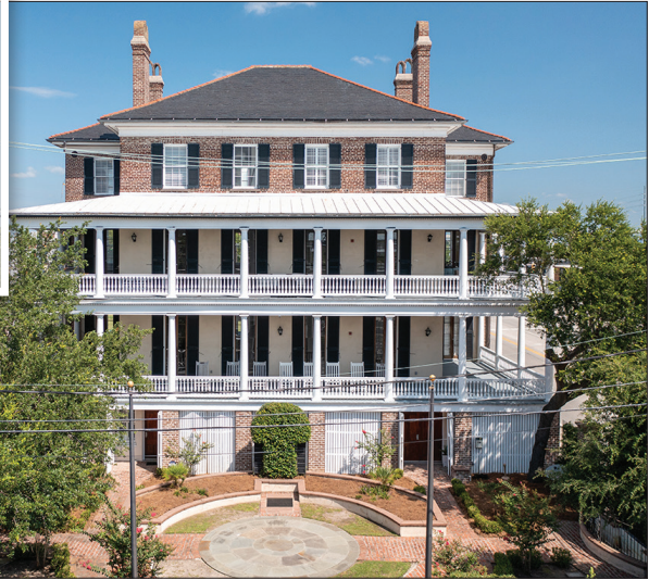
Coastal Real Estate Photo (2)