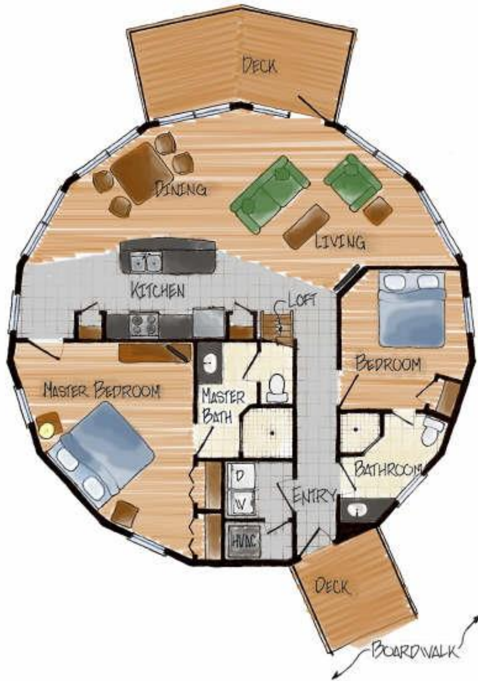
ONE STORY LAYOUT